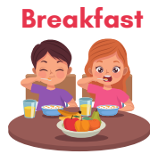
Figure - Q