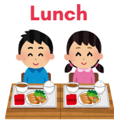
Figure - P

9. Activities in Figure-P and Figure-Q occur in _____ and _____